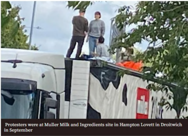
Protesters were at Muller Milk and Ingredients site in Hampton Lovett in Droitwich in September